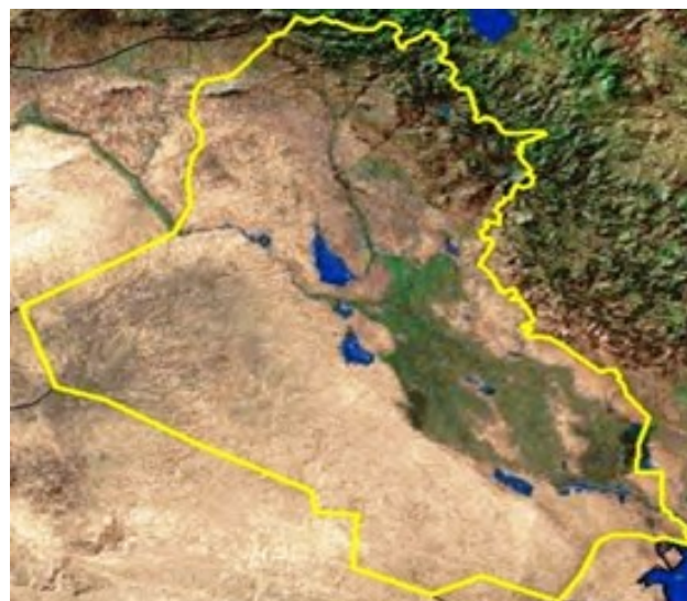
Map.1: Location of the Study Area.